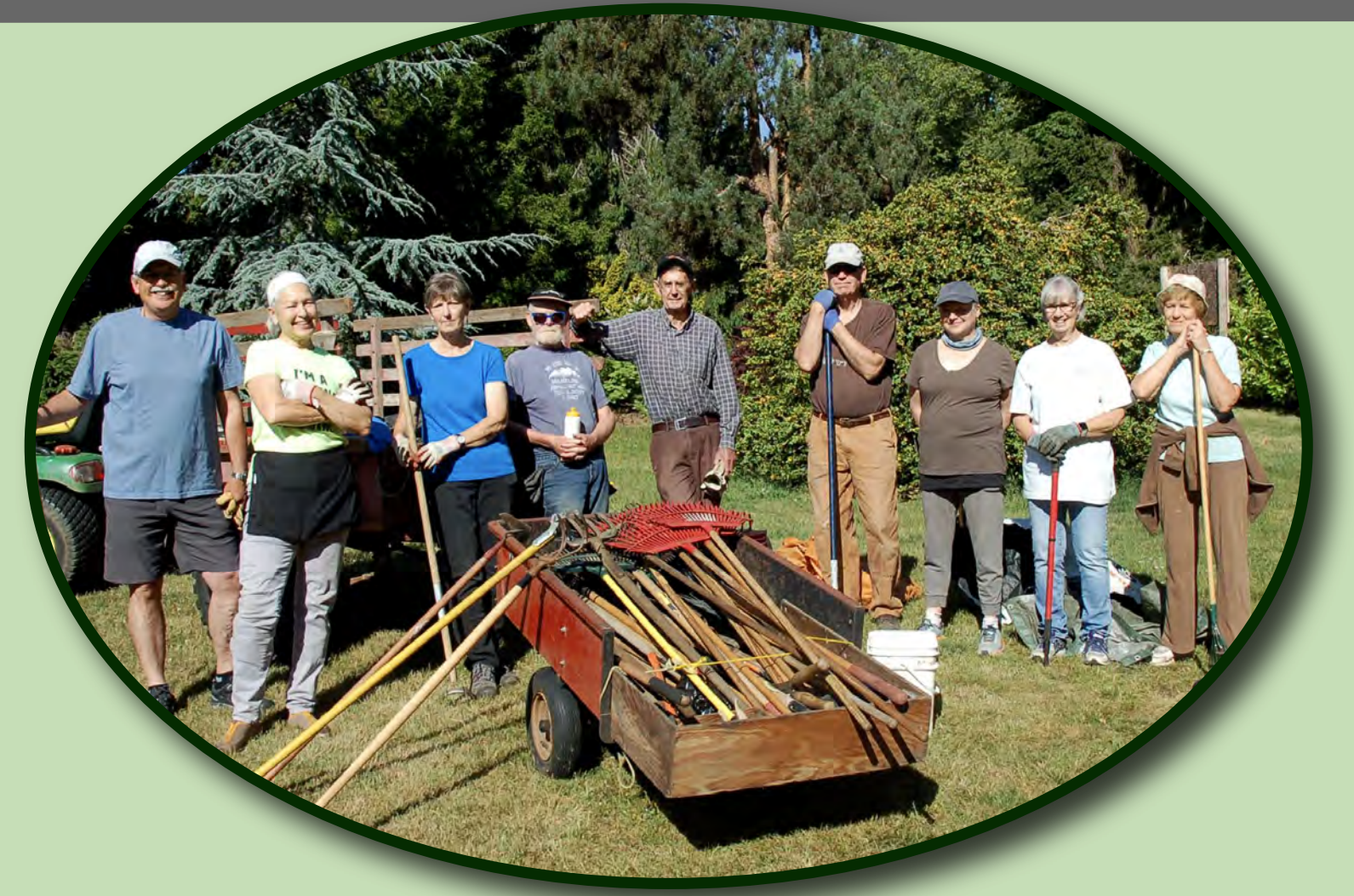
Volunteers with the Friends of Dominion Brook Park Society contribute to the restoration of the grounds and the maintenance of the ornamental gardens. For volunteer opportunities, please visit dominionbrookpark.ca