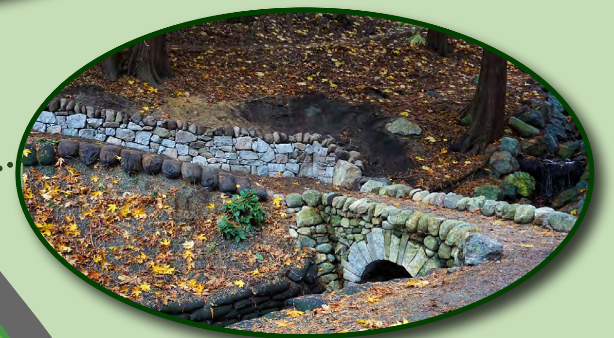
Dry Stone Bridge (2018) and Wall (2019)

For many decades Dominion Experimental Farm was a popular place for social events. Photo is a picnic for Premier Simon Fraser - a strong supporter of the park. Circa 1930s