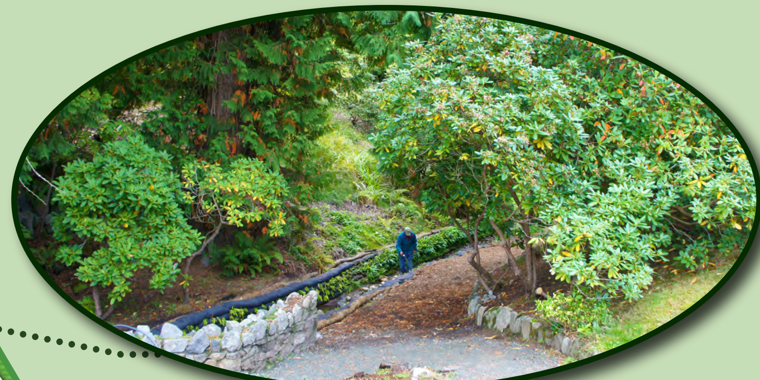
Ravine path 2017