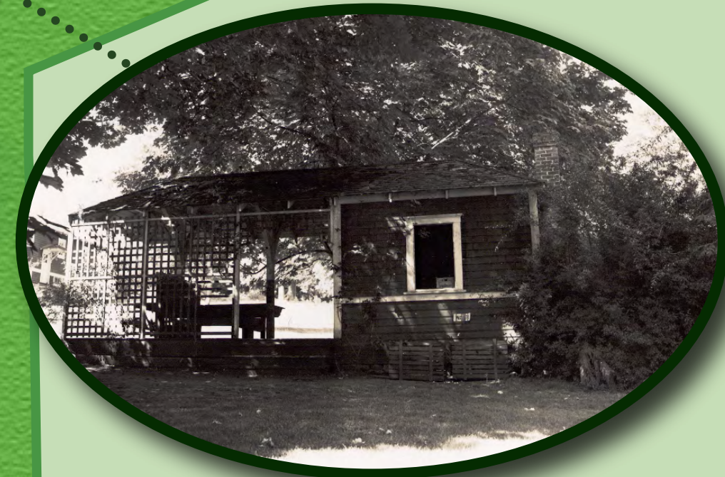
Tea House 1926