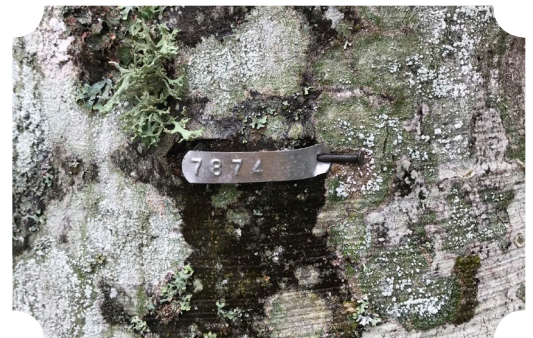
Identification tag on European Beech